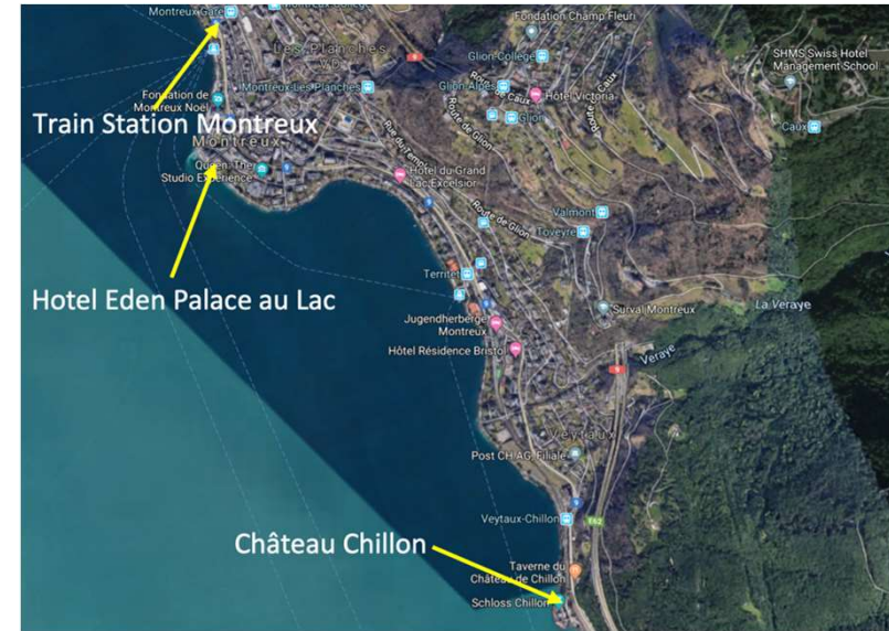
Train Station Montreux