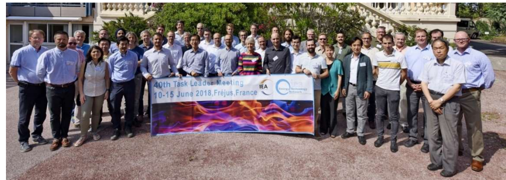
40 th Task Leaders Meeting (2018)