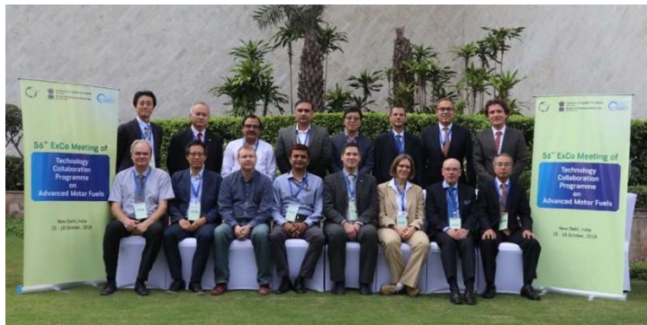
56 th ExCo-Meeting (2018)