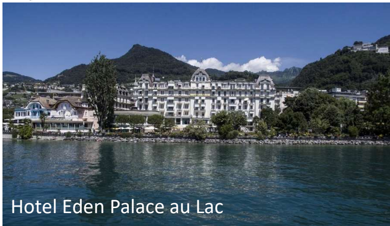
Hotel Eden Palace au Lac